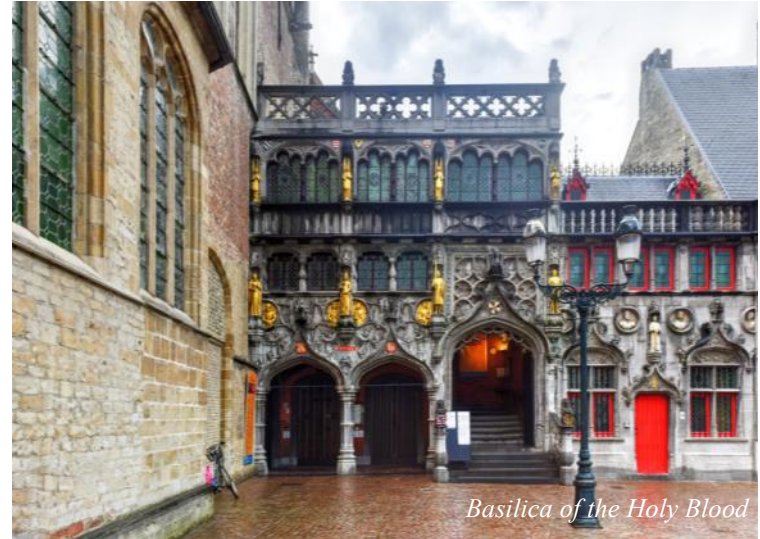
Basilica of the Holy Blood

Bruges is a pretty little medieval canal town on the Belgian coast. It got its start in the textile industry, and you can still see women working on the handmade lace and needlework that's made the region famous. We'll start the day with a walking historic tour, including stops to the Church of the Holy Blood, the markets, and the downtown buildings. During the tour we'll learn about the history of the Benguinage, the home for lay religious women, that