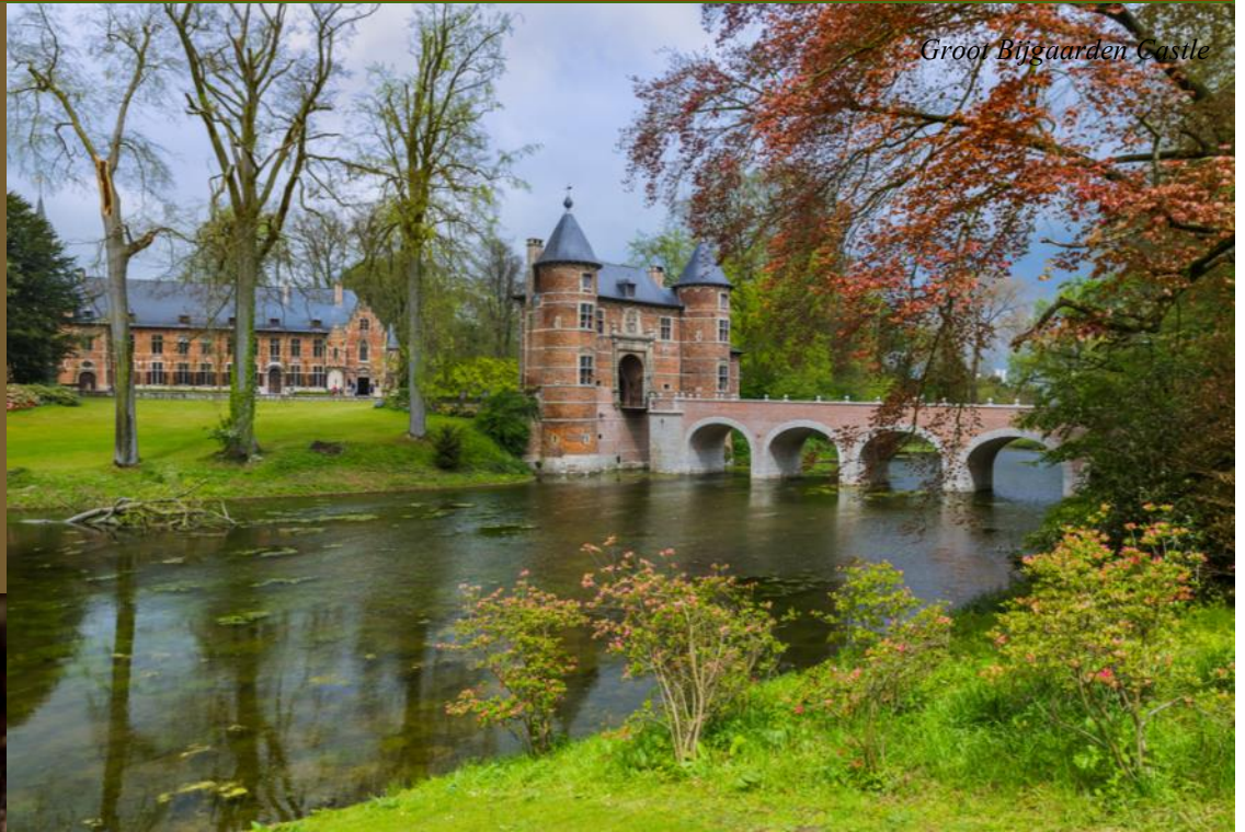
Groot Bijgaarden Castle

SCHEDULED DEPARTURE September 12 - 19, 2019