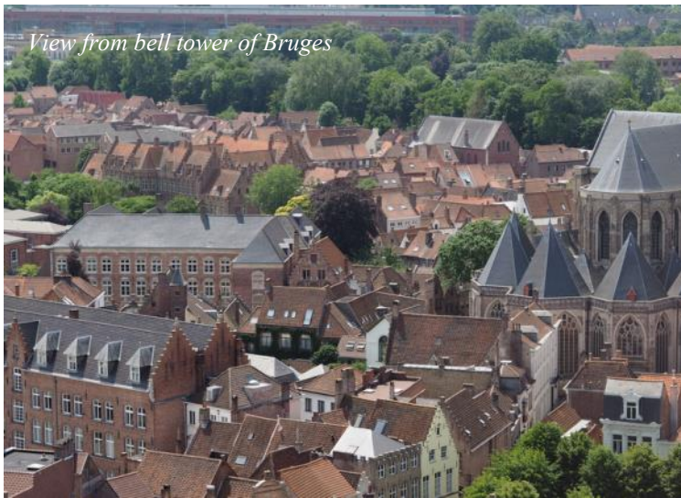
View from bell tower of Bruges

dominates the downtown area. We'll stop into the Beer Temple and see how many of the varieties shown on the Great Belgium Beer Wall we've yet to sample. We'll also get a chance to sample the chocolates of the 3 rd generation to run Chocolates de Clerek, and also the forward thinking Chocolate Line. We will have dinner in one of the city's many historic buildings. B/D