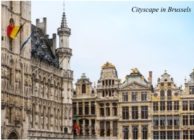
Cityscape in Brussels