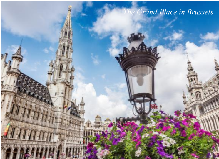
The Grand Place in Brussels

Today, we stretch our legs and get to see Brussels through a walking tour of the central part of the city. We'll start with the morning flower markets in Grand Place, and talk about some of the buildings that surround the square. We will visit the Basilica of Brussels. There will be visits to "Butter Street", where we can choose to visit Godiva, Neuhaus, Galler or