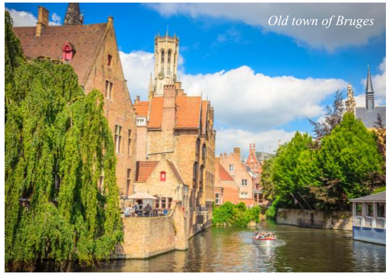
Old town of Bruges

Leonidas chocolatiers. We'll visit the Brussels Brewers House & Museum, before a brewer's lunch in one of the many restaurants. After lunch, we'll stroll through the city sights with Cantillon Brewery as our destination for a tasting and tour. Dinner will be on your own so that you may choose one of the many ethnic restaurants, a quick bistro dinner and walk, or one of Brussels' fine dining establishments. B/L