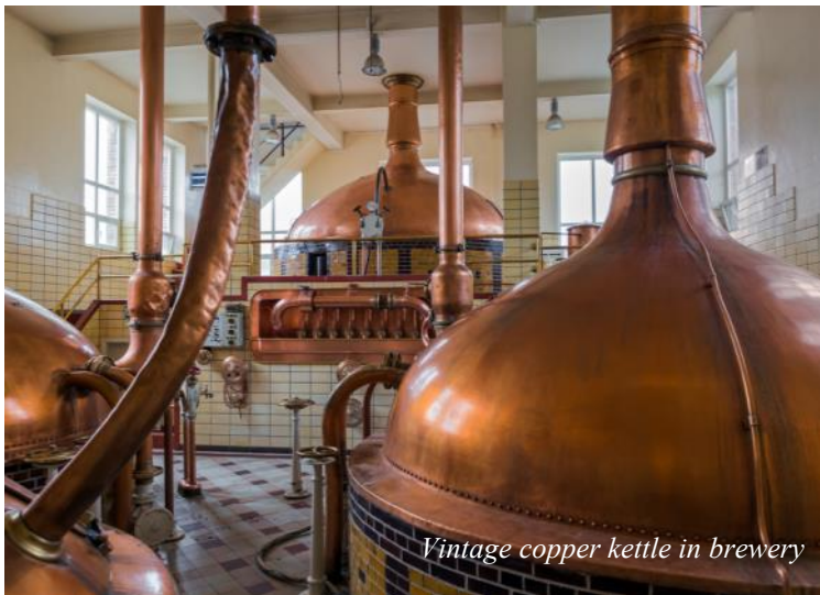
Vintage copper kettle in brewery

Abbreviations for Meals B=Breakfast, L=Lunch D=Dinner