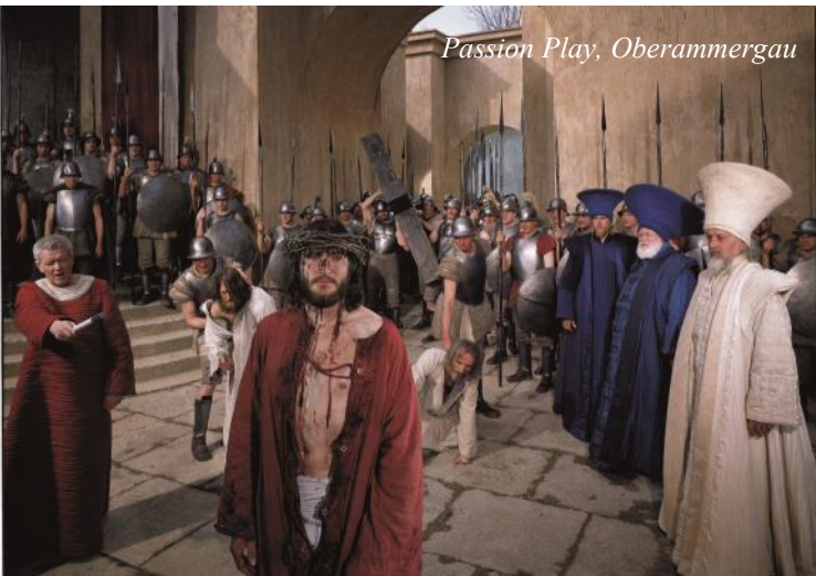
Passion Play, Oberammergau