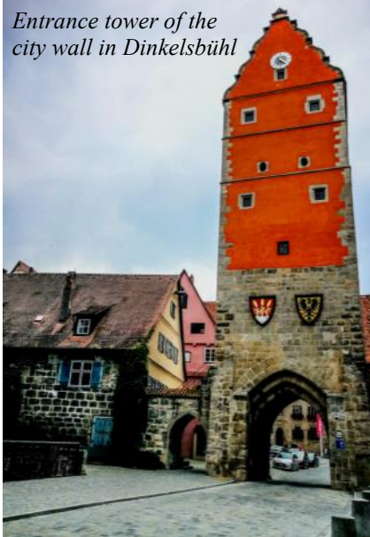
Entrance tower of the city wall in Dinkelsbühl