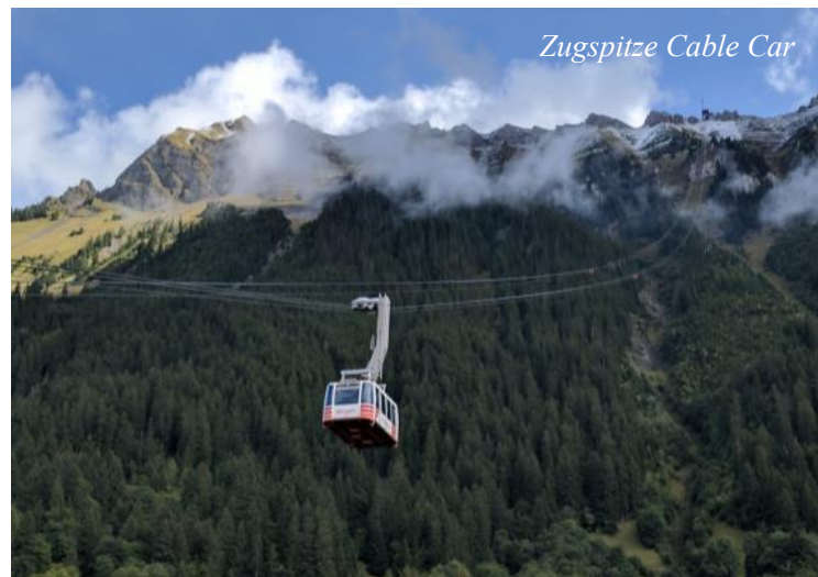
Zugspitze Cable Car

Today we head to Oberammergau. First, we stop at the Monastery of Ettal where we learn how the monks brewed beer and of course sample the beer and cheese. We also visit