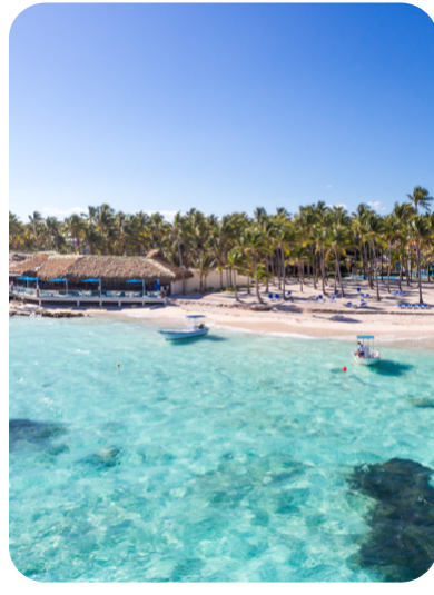
Punta Cana Dominican Republic Family favorite with an adult-only Zen Oasis.