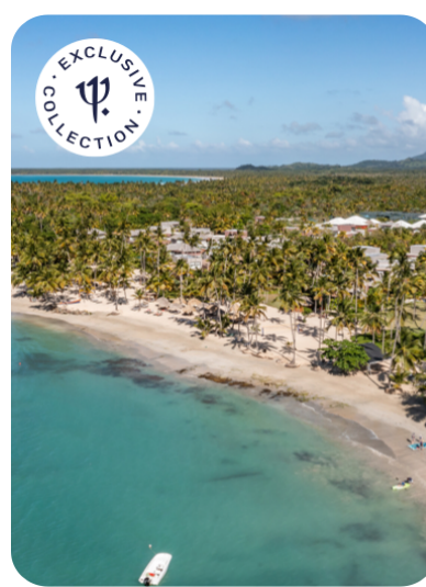
Michès Playa Esmeralda Dominican Republic First Exclusive Collection Resort in the Americas.