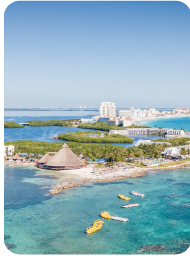
Cancún Mexico Family favorite with an Exclusive Collection Space.