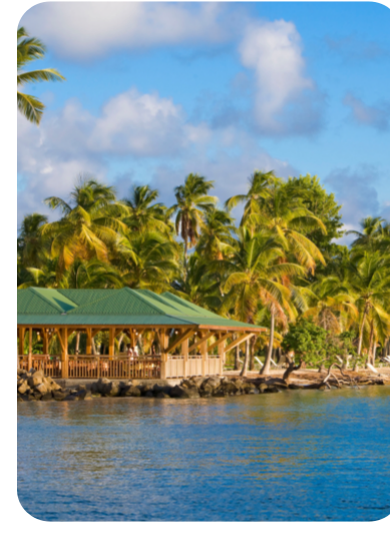
Buccaneer's Creek Martinique A paradise for water sports lovers.