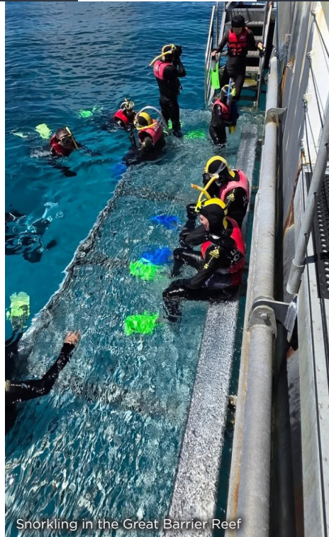
Snorkling in the Great Barrier Reef

*Offer valid on new retail bookings only. Offer applies to land package only and does not apply to any other required supplements or internal air. Offers can expire earlier due to space or inventory availability. Space is on a first come, first served basis. Offers are not valid on group or existing bookings. Offers are combinable with member benefits only and are not combinable with any other offers. Discount level and availability varies by destination and month of travel. Other restrictions may apply.