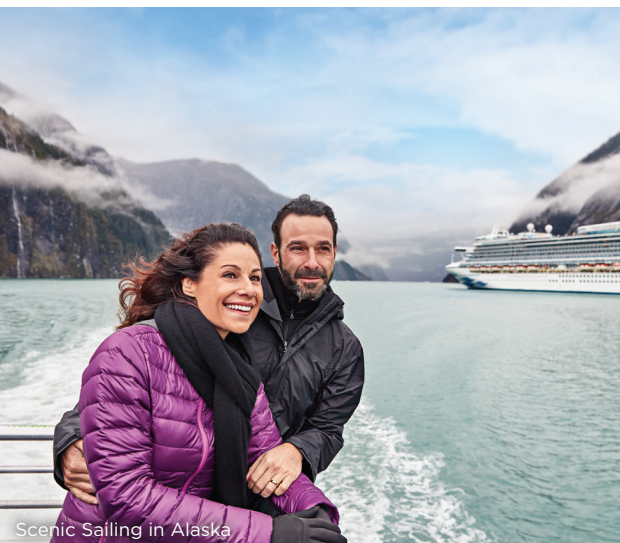
Scenic Sailing in Alaska