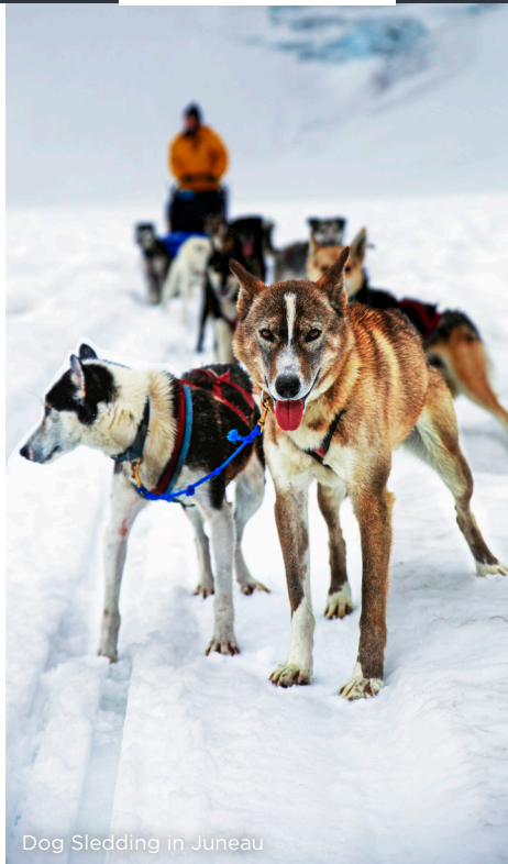
Dog Sledding in Juneau

*Taxes, fees and port expenses are included in listed pricing above. Prices may vary based on departure date, category, and/or itinerary and are subject to change without notice. Cruise must be booked during offer period to qualify. All offers are capacity controlled; availability varies by sailing, and eligible staterooms may sell out. All offers are non-transferable and applicable only to the Offer Cruise. Additional terms and conditions may apply. Contact your travel advisor for full details. ©2026 Celebrity Cruises Inc. Ships' registry: Malta and Ecuador.