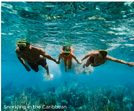
Snorkling in the Caribbean

Itinerary: Ft. Lauderdale, Florida; At Sea; Cozumel, Mexico; Belize City, Belize; Roatan (Mahogany Bay, Honduras); At Sea; Ft. Lauderdale, Florida