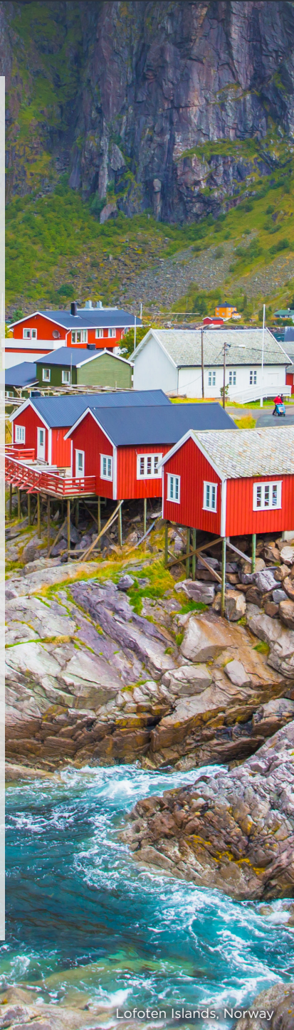
Lofoten Islands, Norway

This is where a trusted travel advisor makes all the difference. With industry knowledge, global connections, and access to experiences most travelers wouldn't find on their own, they can guide you beyond the ordinary. Charming villages, boutique stays, unforgettable cruises, and once-in-a-lifetime journeys are all within reach with the right guidance.