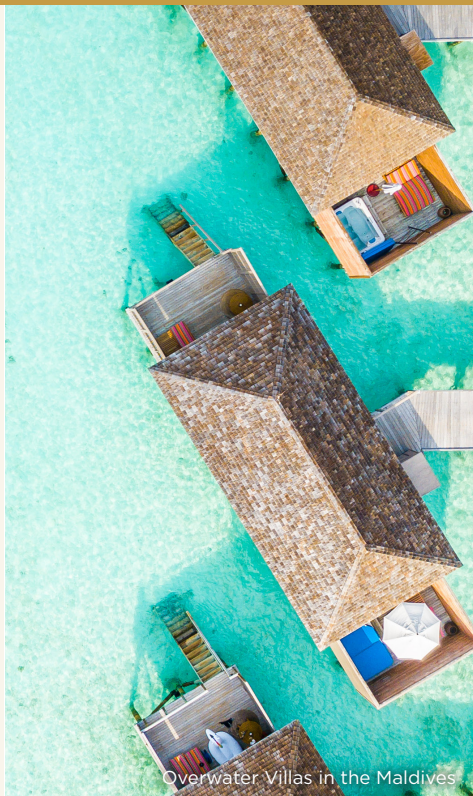
Overwater Villas in the Maldives

Luxury travel can take many forms, each offering its own distinctive sense of indulgence and discovery. Working with a travel advisor is one of the best ways to elevate a luxury travel experience. Imagine staying in an overwater villa in the Maldives, where glass floors reveal vibrant marine life below, or embarking on a private safari in Serengeti National Park with expert guides and exclusive lodges. A luxury cruise may be more your speed. Unpack once while visiting multiple ports and see some of the world's most beautiful locations in Europe, the South Pacific, and the Caribbean.