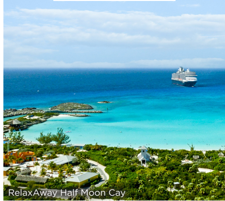
RelaxAway Half Moon Cay

*Fares are based on Promo(s) DIN*. Featured fares are per person based on double occupancy and available for 1st/2nd guests only. Advertised fares include taxes and Fees. Fares are based on Have It All pricing/package offer (N*), Verandah category VH. Unless otherwise noted, all elements of the Anniversary Sale (collectively, "Offer") are available only on select 2026 & 2027 cruises and exclude Grand Voyages and any cruise lasting three days or less. Offer has no cash value and is subject to availability, capacity controlled, available on new bookings only, and neither transferable, substitutable, nor redeemable for cash. May not be combinable with other offers. Holland America Line ("HAL") may modify or withdraw Offer or any of its elements at any time. HAL is neither responsible nor liable for any errors relating to Offer, including technical or printing errors. Exclusions may apply; void where prohibited. Changes or refunds may not be permitted. Additional terms & conditions can be found at https://mvptravel.com/wp-content/uploads/2026/03/HAL_TCS_April25VM.pdf . Ships Registry: The Netherlands.