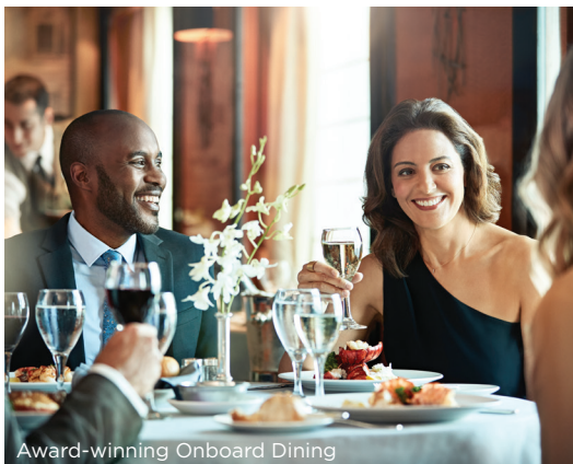
Award-winning Onboard Dining